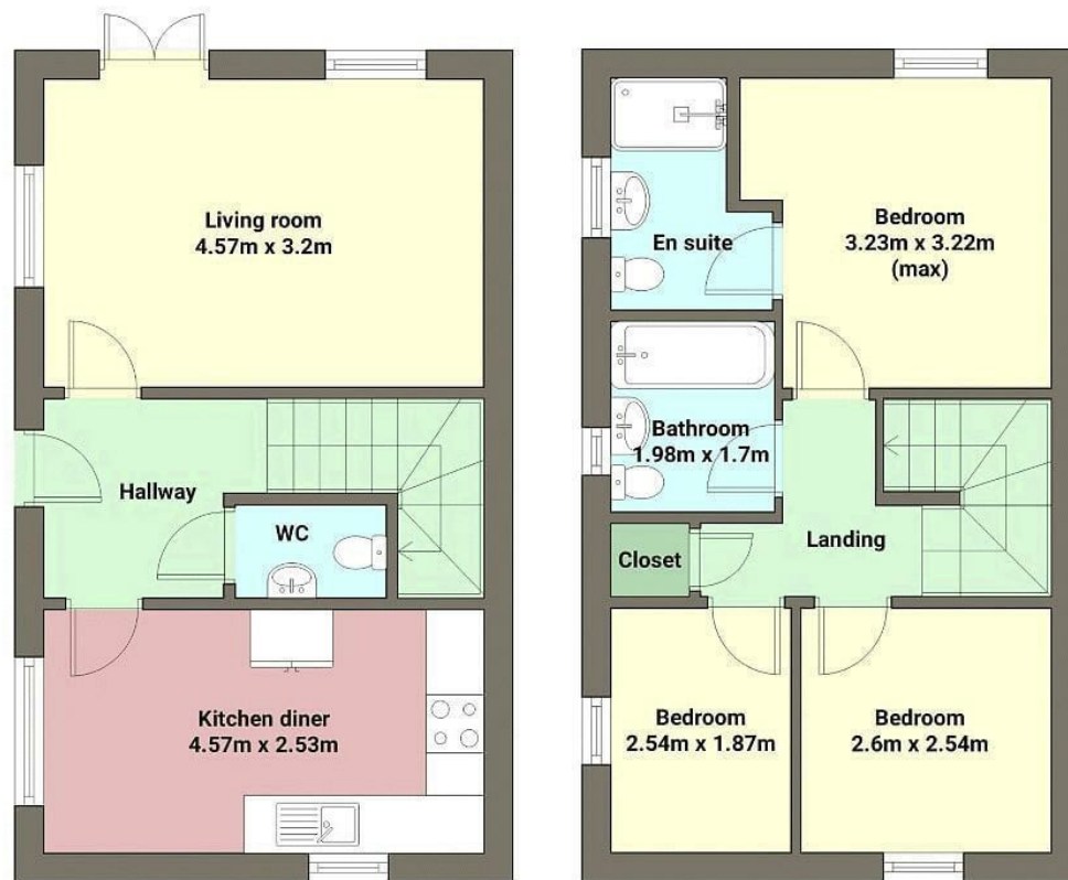
Ground floor Area: 35.2 m 2